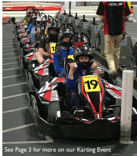
See Page 3 for more on our Karting Event

The autocross was not fast enough for some members so we met on Saturday March 5th at Autobahn Indoor Karting and ripped it up on their indoor karts. Electric motors can really