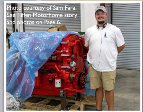
See Tiffin Motorhome story and photos on Page 6.