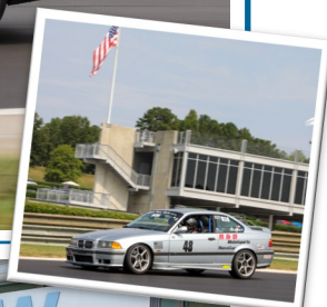
HPDE photos courtesy of Albert Hicks. Be sure to check our Facebook page for more event photos.