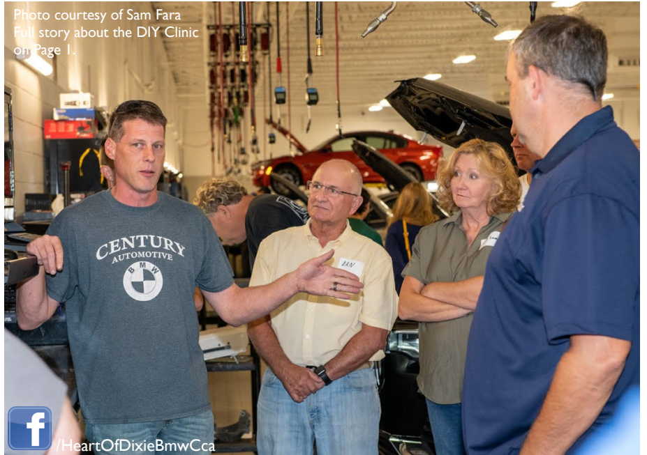
Full story about the DIY Clinic on Page 1.

Please join us for our next Fun Run on Saturday, October 5th , to Honeycomb Natural Bridge followed by lunch at Rock House Eatery in Guntersville, AL. We will meet in Dodge City and take some twisty and scenic backroads to Honeycomb Natural Bridge in Guntersville. After our drive and stop at Honeycomb we'll make the short drive to Rock House Eatery for some lunch and social time.