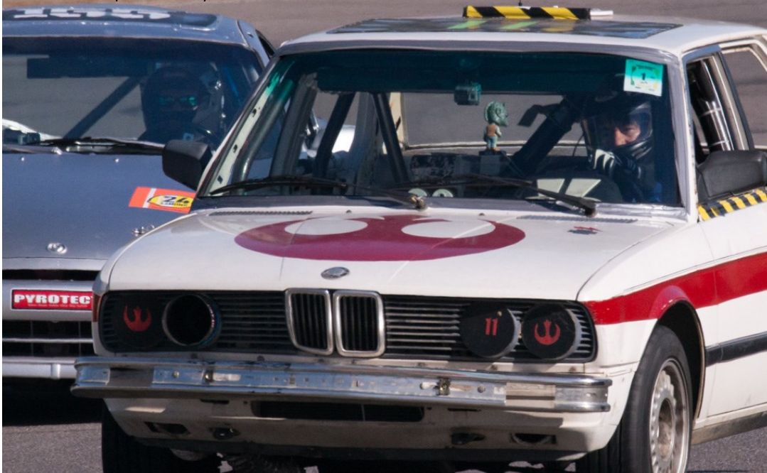
24hrs of LeMons

Did we see at our Barber Motorsports Kick-off Party and the 24 Hours of LeMons? See Pages 3, 4 and 8 for more pictures. We have lots of adventures planned this year. Stay tuned to our web-site, Facebook page, newsletter and your e-mail for the latest events and registration. We look forward to seeing you in 2017!