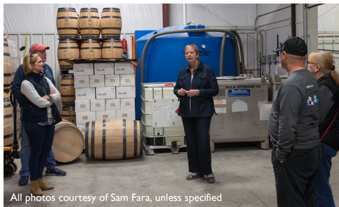
All photos courtesy of Sam Fara, unless specified