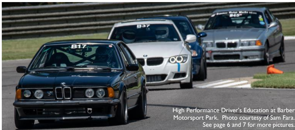
High Performance Driver's Education at Barber Motorsport Park. See page 6 and 7 for more pictures.