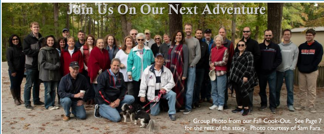
Group Photo from our Fall Cook-Out. See Page 7 for the rest of the story.