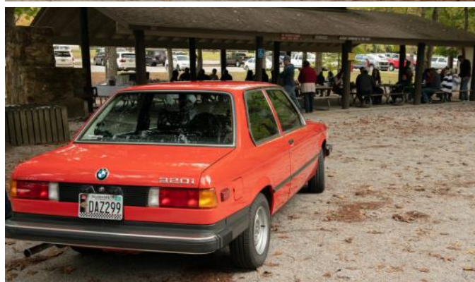
High Performance Driver's Education.