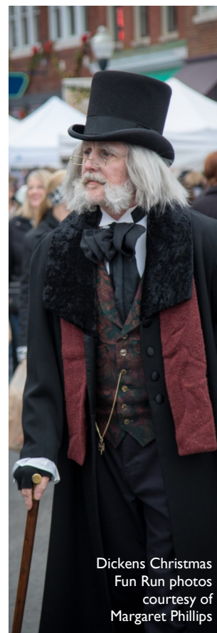
Dickens Christmas Fun Run