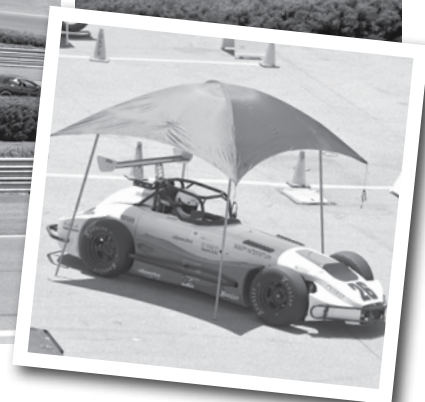
Scenes from the 2011 Driver's Event at Barber Motorsport.